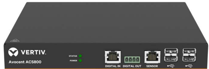
Avocent® ACS 800

An advanced serial console enables remote management of servers, routers and switches, in addition to supporting capabilities such as environmental monitoring and internet of things (IoT) integration. It is also an ideal foundation for centralized management of multiple remote sites. For example, a system such as the Avocent® ACS 800, which is designed for edge site management, includes sensor ports to connect temperature, humidity, differential pressure, leak, and door pin sensors in addition to remote equipment access.