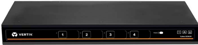
Avocent® Cybex SC845H

At the basic level, desktop switches provide access to multiple computers from a single KVM (keyboard, video monitor and mouse). When equipped with advanced security features, these tools allow users to switch safely and securely between computers operating at different classification levels, providing continuous access to critical data in security-sensitive environments.