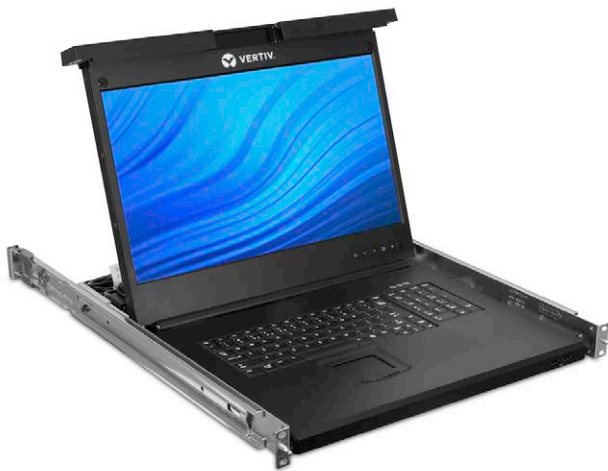
Avocent® 19" Local Rack Access Console

A local access controller provides access to multiple servers to simplify the process of making software upgrades, troubleshooting and system monitoring. They provide an ideal solution for local management of remote sites but are not designed to support remote management.