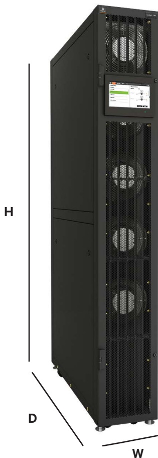
Liebert® CRV 300 mm DX