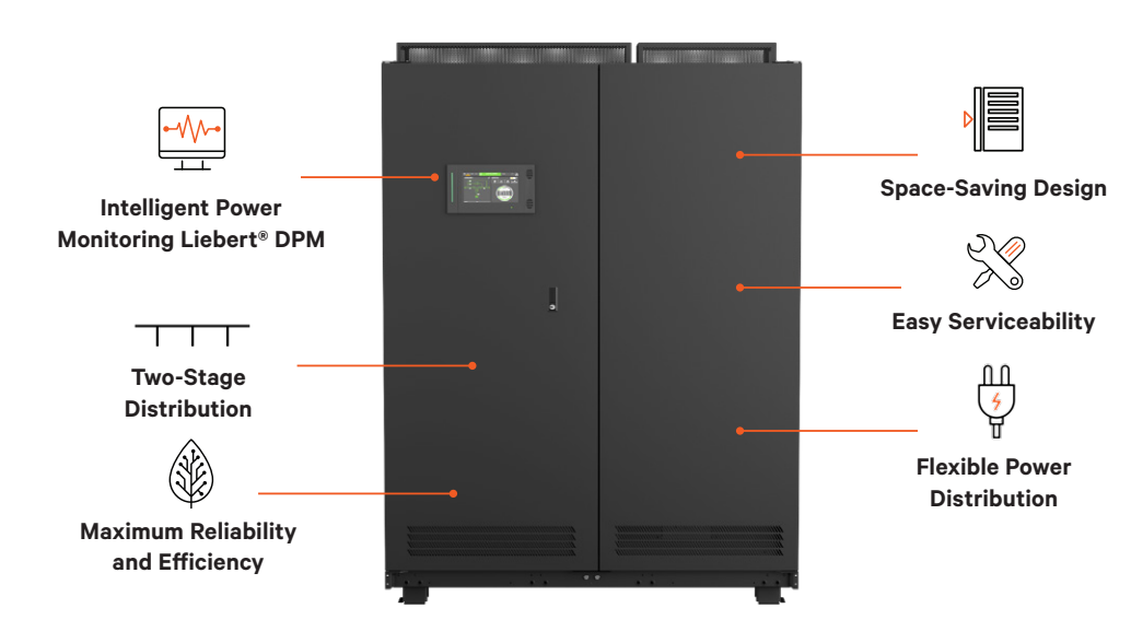
Vertiv™ Liebert® PPC 400-750kVA

The PDU is shipped to you with a custom configuration of sub-feeds, created for your specific site power requirements.