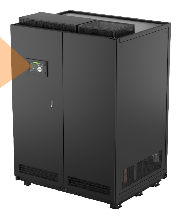
Vertiv™ Liebert® PPC 400-750kVA

In the above figure, at left is a "single-line," an electrical diagram of the PDU unit, showing the input, the transformer, and the output distribution of branch panelboards and subfeed breakers. At right is the PDU's total output load, with individual power levels for each phase in a 3-phase distribution, including voltage and amperage for each phase.