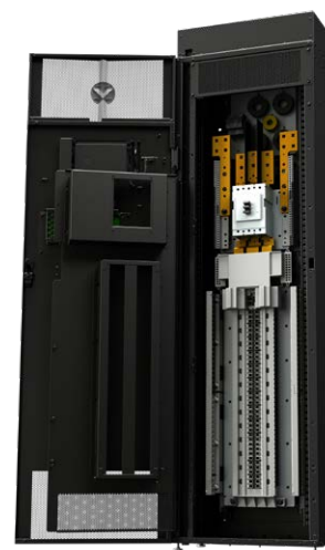
Figure 2. Liebert® RXV (internal view - fingersafe option)