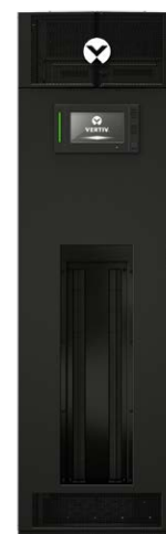
Figure 3. Liebert® RXV with Optional Viewing Window door