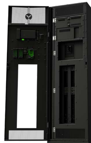
Figure 1. Liebert® RXV (second access door view)

** 42 and 84 Poles Available in 208V only