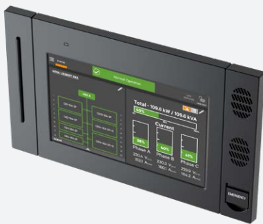
Figure 1. Front 9" touch screen coloured display with visible and audible alarms to prevent downtime

The display's frame includes LED and speakers with easily programmable alarms for faults or warnings: