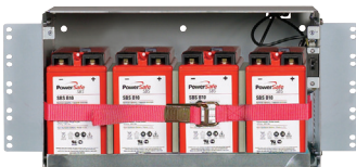
Optional NetSure 48V Battery Cabinet