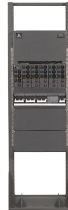
Hybrid NetSure 5100 with 2 Row External Distribution