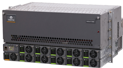
NetSure 5100 with External Distribution