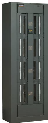
NetSure Distribution Bay

High capacity, modular bays deliver effective secondary -48V DC load distribution with increased visibility and detailed understanding of all loads in your core facility. These top or bottom feed distribution bays deliver 4,800 amp (eight panel) or 3600 amp (six panel) continuous rating with an interrupting capacity of 10,000 amps. Ideal for colocation and core facilities including cable headends, MTSOs and MSOs requiring protection of power plants up to 640 amp capacity per load.