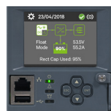
Individual current measurement for each fuse/breaker