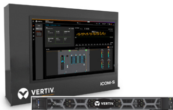
Liebert® iCOM™-S Panel and 1U Appliance