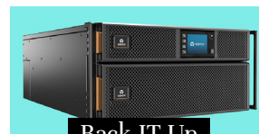
Back IT Up

Whether your customers are scaling to a new location or filling out a new IT network closet, the rack is the backbone of their edge computing space.