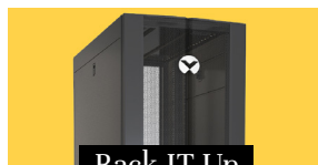
Rack IT Up

Whether your customers are scaling to a new location or filling out a new IT network closet, the rack is the backbone of their edge computing space.