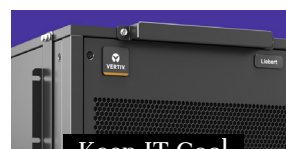
Keep IT Cool

Provide reliable power distribution to critical IT equipment within a rack or cabinet. PDUs are available in a variety of electrical and receptacle configurations.