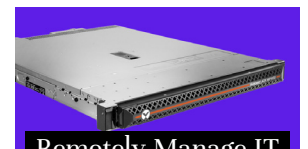
Remotely Manage IT

Your customers critical networking equipment deserves to be backed up with reliable, efficient UPS.