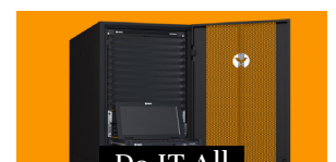
Do IT All

Extend the service life of your customers critical IT equipment by optimizing operating temperatures in their edge computing environment.