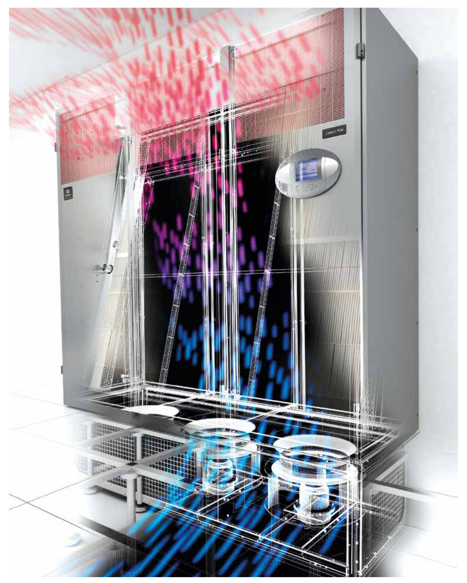
Liebert® PCW with High Chilled Water Delta T