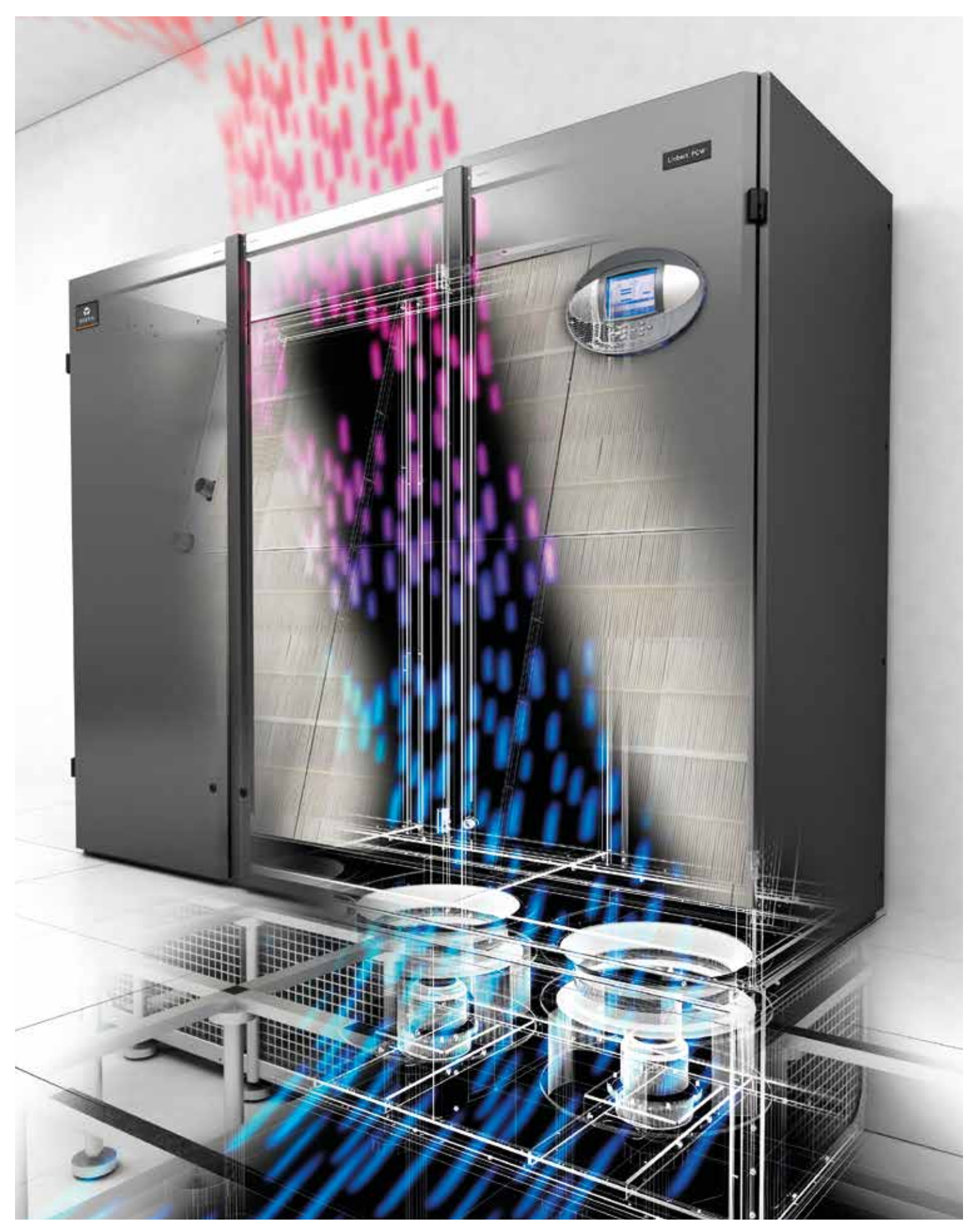
Liebert® PCW designed for the lowest air resistance