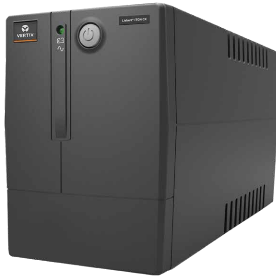
Liebert® ITON™ 650VA CX