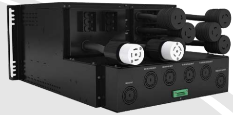
(shown above, MBC rear view with (2) PODs installed)

Rev up your engine with a compact 8 or 10kVA, 208/220V, three phase UPS that offers an intuitive control panel and fits in a rack or on the floor.