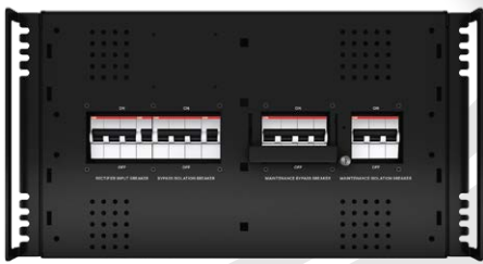
(shown above, MBC front view with cover removed)

Fill 'er up. Matching battery cabinets will meet your backup needs. Add two more for additional runtime. Batteries are easy to connect and install to keep your IT equipment up and running.