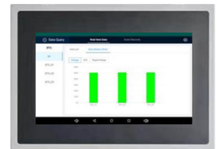
7 inch Touch Screen Display