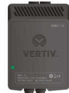
Single Cell Detection Module