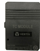
Current Detection Module