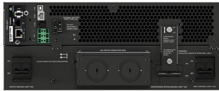
Liebert® GXT5 6kVA