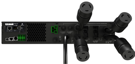
Liebert® GXT5 3kVA