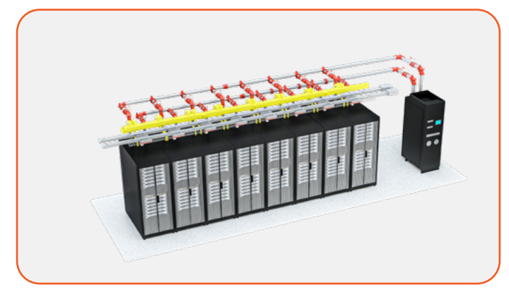
Vertiv<sup>™</sup> MegaMod<sup>™</sup> CoolChip with Vertiv<sup>™</sup> Perimeter Cooling

Vertiv has developed three Vertiv™ MegaMod™ CoolChip concept designs to support direct-to-chip liquid cooling solutions, differentiated in the way that they address the air-cooled architecture portion. Each air-cooled architecture has its own benefits - from flexible perimeter cooling, to room neutral in-row cooling and finally the space-saving rear-door heat exchangers - find which design is the right fit for your data center.