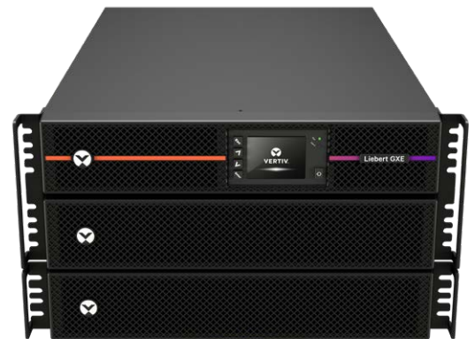
Vertiv™ Liebert® GXE 6kVA shown with an optional 2U external battery cabinet