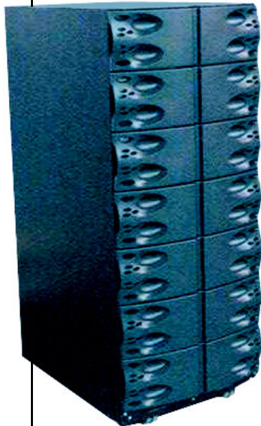
External Battery Cabinet