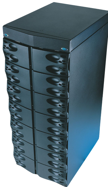
Extended Battery Cabinet

Nfinity With Extended & External Battery Cabinets