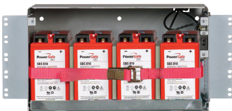
Optional NetSure 48V Battery Cabinet