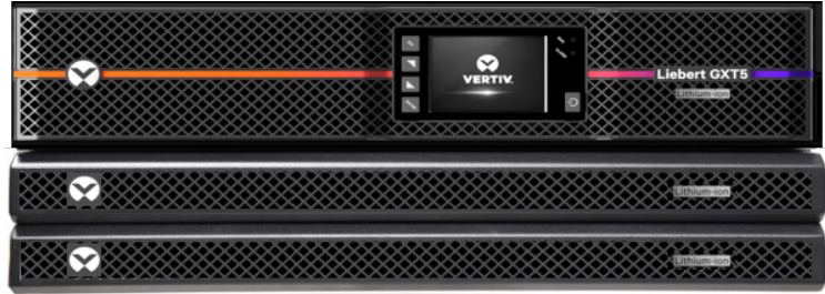
Liebert® GXT5LI 1-3KVA UPS and (2) EBC For Extended Runtime

Lithium-ion technology delivers two to three times the useful life of lead-acid batteries along with a lower total cost of ownership, making the Liebert® GXT5 Lithium-Ion online UPS ideally suited for network and server rooms, and other mission-critical edge applications.