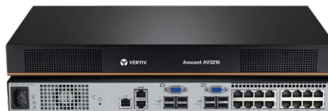
AV3216: Vertiv™ Avocent® AutoView™ 32-port switch