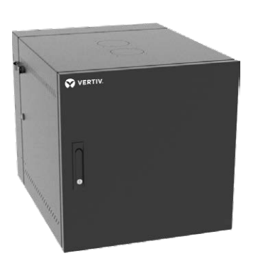
Vertiv(TM) VR Wall Mount Rack