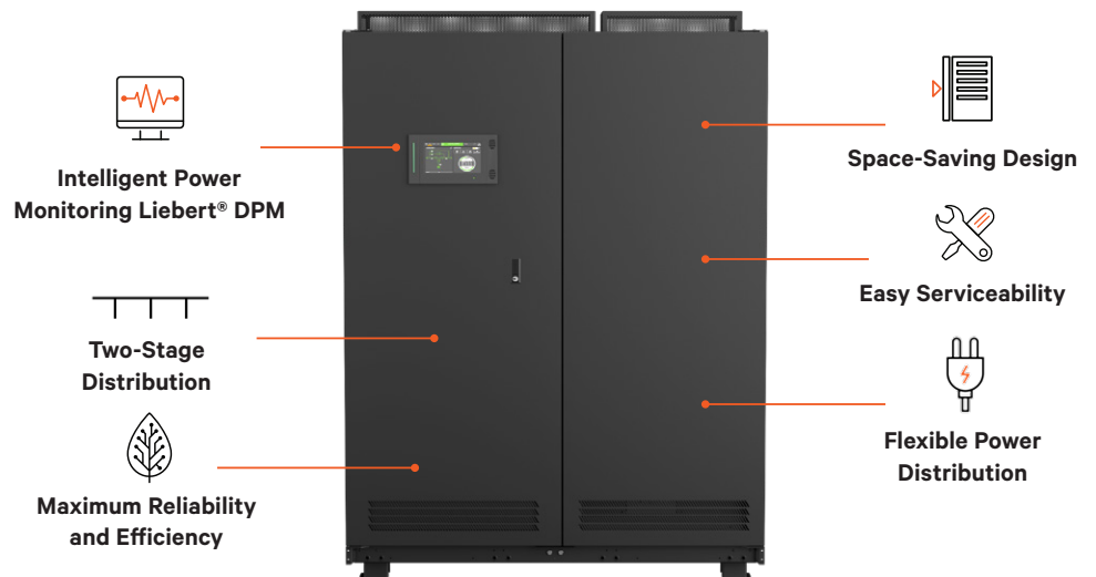
Vertiv™ Liebert® PPC 400-750kVA

The PDU is shipped to you with a custom configuration of sub-feeds, created for your specific site power requirements.