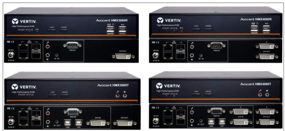
Avocent® HMX 3080T/R

Fully OSD interface; Plug-and-play, no need to set up individually, all the device lists can be automatically obtained and initialized from any receiver.