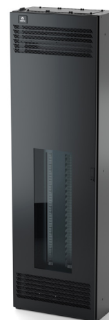
Figure 3. Liebert® RXA without Liebert® DPM monitoring system