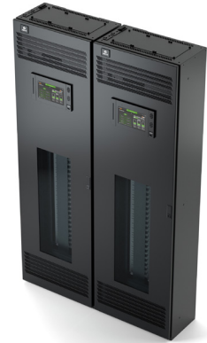
Double: 328 mm x 1207 mm (13" x 48") | 168pole | 250/400 A