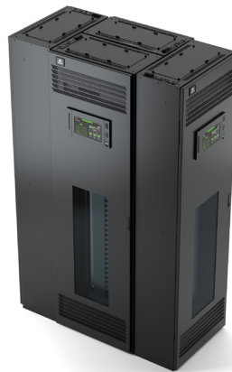
Quadruple: 603 mm x 1260 mm (24" x 50") | 336pole | 250/400 A