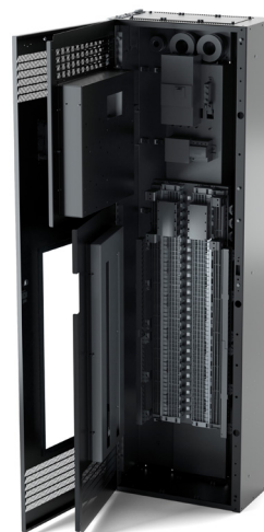
Figure 2. Liebert® RXA (internal view)