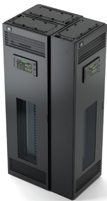
Triple: 603 mm x 932 mm (24" x 37") | 252pole | 250/400 A