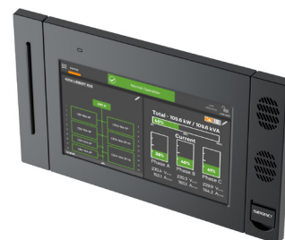
Figure 1. Front 9" touch screen coloured display with visible and audible alarms to prevent downtime

The display's frame includes LED and speakers with alarms for faults or warnings, all easily programmable: