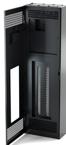
Figure 1. Liebert® RXA (second access door view)

*Not included in the Liebert® RXA model without a monitoring system