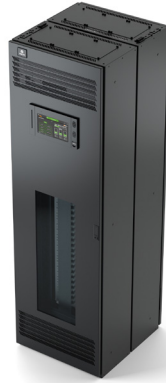
Double: 603 mm x 603 mm (24" x 24") | 168pole | 250/400 A