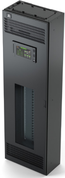
Single: 328 mm x 603 mm (13" x 24") | 84pole | 250/400 A

The flexible Liebert® RXA is easily configured to accommodate current site needs and future growth.