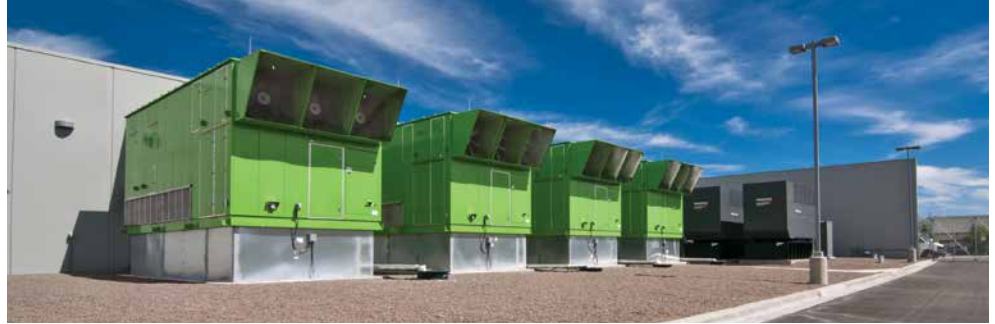
Liebert Indirect Evaporative Freecooling Units deployed at Green House Data, Cheyenne, WY