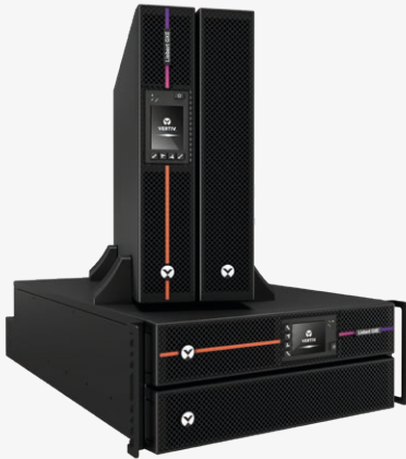
Vertiv™ Liebert® GXE 6kVA in a flexible rack or tower mounting form factor