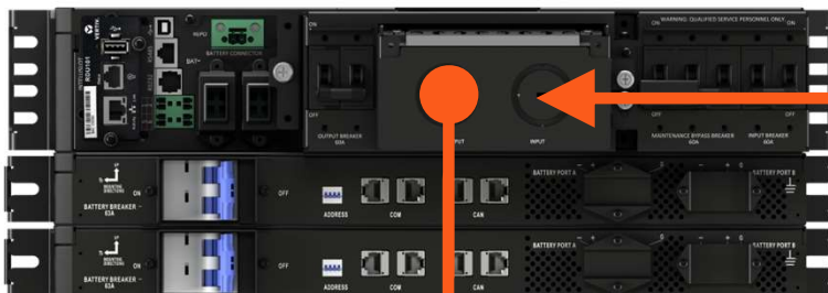
GXT5LI 6-10kVA UPS

All GXT5LI 6-10kVA models are hardwire input and hardwire output. They require an electrician for installation.