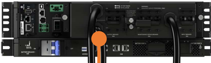
GXT5LI 5kVA UPS

GXT5LI-5KL630RT3UXLN: L6-30P Input, (2) L6-30R Output GXT5LI-5000MVRT3UXLN: L14-30P Input, (2) L14-30R Output