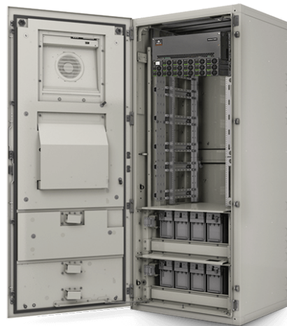
84" Vertiv XTE 601E Enclosure Shown with DC Air Conditioner and NetSure 5100 DC Power System

The Vertiv XTE 601E Series is a full featured modular line of outdoor enclosures ideal for use in macro cell site and C-RAN applications.