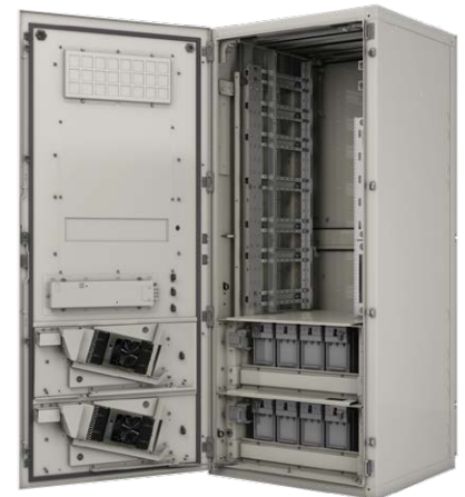
84" Vertiv XTE 601E Enclosure Shown with 3500 W Heat Exchanger and two 300 W Thermoelectric Coolers