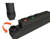
Vertiv™ Geist™ UPDU, Universal Power Distribution Unit