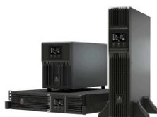
Vertiv™ Liebert® PSI5 Lithium-Ion UPS, 1500-3000VA