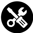
Installation & Startup Services