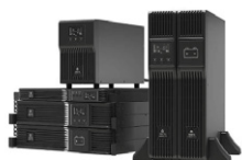
Vertiv™ Liebert® PSI5 Line-Interactive UPS, 750-5000VA