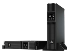
Vertiv™ Liebert® PSI5 UPS, TAA-Compliant, 1,500-3,000VA