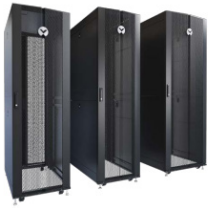
Vertiv™ VR Rack System

Deploy an all-in-one modular data center quickly for powerful computing capacity in a small physical footprint.