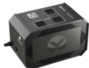
Vertiv™ Liebert® Power-UPS Lithium, Lithium-Ion UPS, 400VA