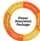
Power Assurance Package