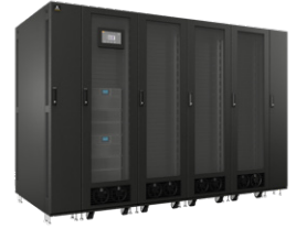
Vertiv™ SmartRow™ 2