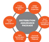
Distribution Assurance Package

For more information visit Vertiv.com/telehealth