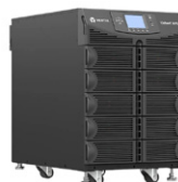
Vertiv™ Liebert® APS UPS, 5-20kVA