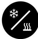
Thermal Maintenance Services