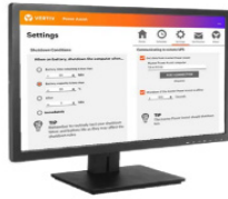
Vertiv™ Power Assist