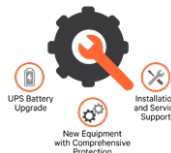
Power Continuity Services