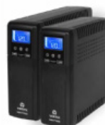
Vertiv™ Liebert® PSA5 UPS, 500-1500VA