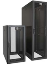
Vertiv™ DCE Rack System