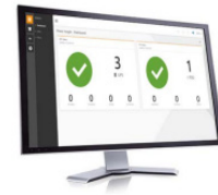
Vertiv™ Power Insight