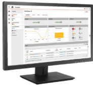
Vertiv™ Environet™ Alert