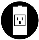
UPS Maintenance Services