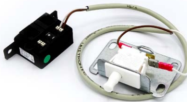
Door Contact Switch