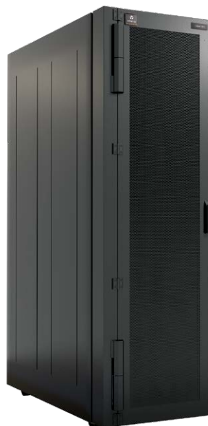
Vertiv™ Liebert® DCD Passive

As your business grows and the cooling demands increase, the Liebert DCD can be added to each rack, providing simple and effective scalability to meet your needs. When heat loads vary throughout the day, it can be difficult to provide proper and efficient cooling to match the demand. The Liebert DCD's wide modulation range allows your facility to quickly adapt to those changing conditions, no matter how frequently they vary throughout the day, providing peace of mind to the end user.