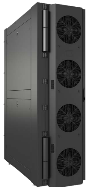
Vertiv™ Liebert® DCD with Active Module