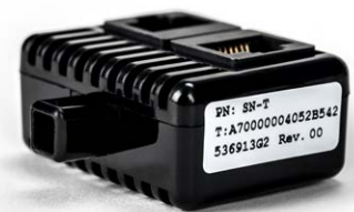
SN-T Temperature Sensor